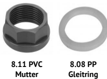
8.11 PVC Mutter