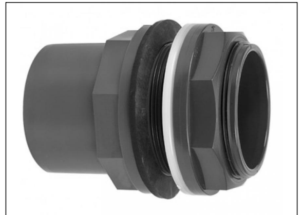
8.08 PP slipping