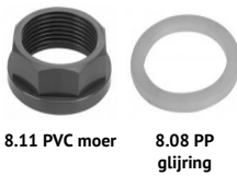
8.11 PVC moer